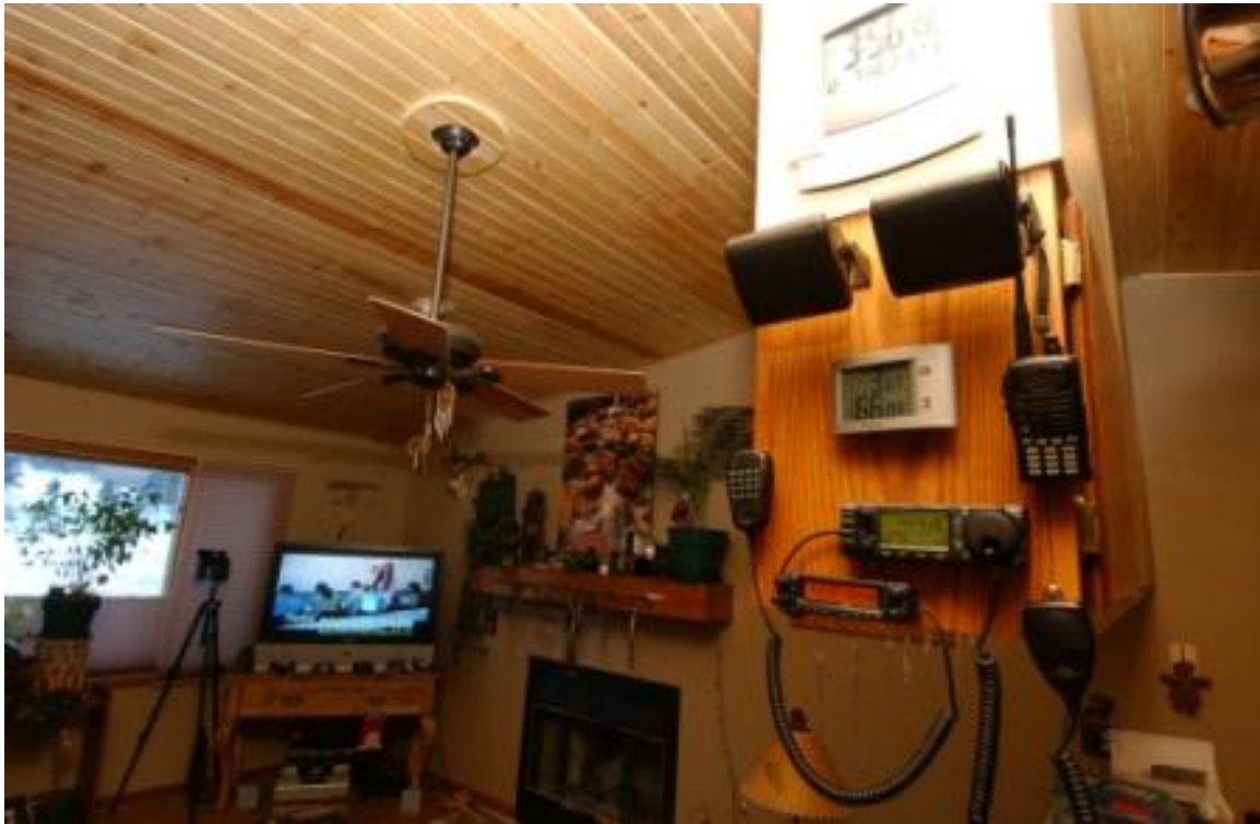
This is the N0WAR Hamshack in Estes Park