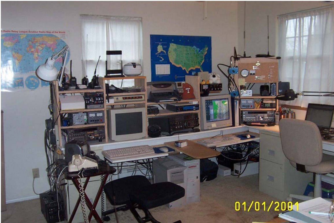
This is the K0UT Hamshack in Fort Collins