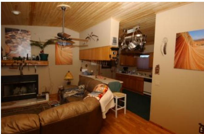
Can you find the hamshack in this picture?