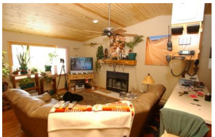
From this angle it's more visible...