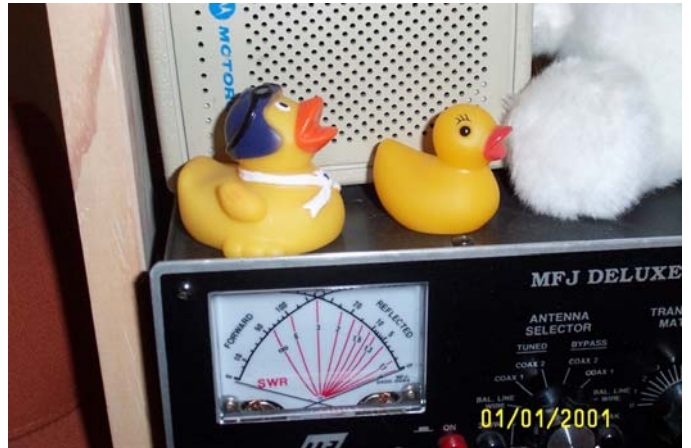
Above images provided by Bill Beach – K0UT