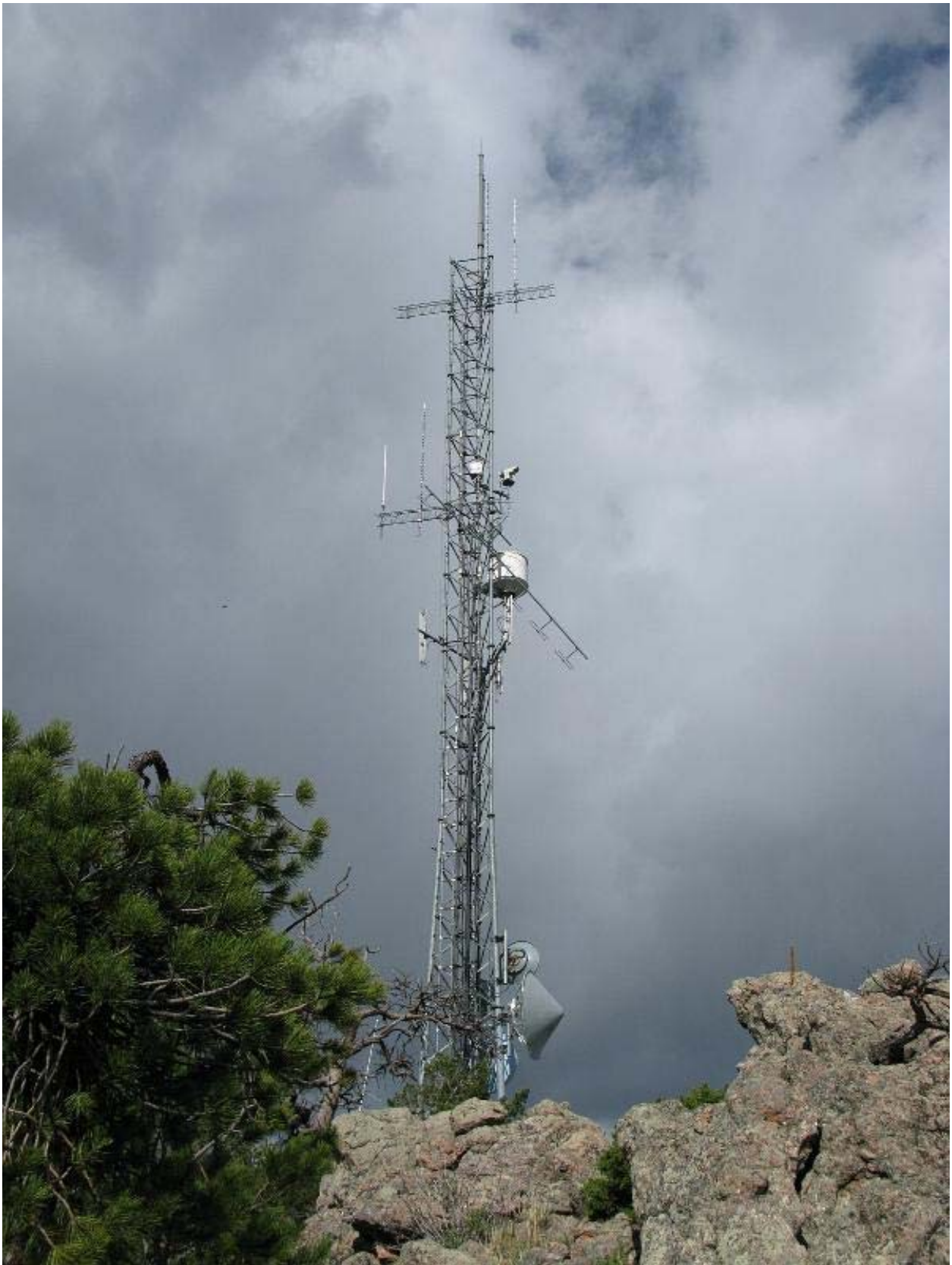
Horsetooth Tower – May 2008 As viewed from the SW side