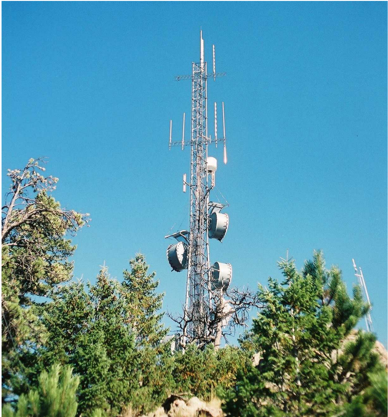
Horsetooth Tower – October 2005 As viewed from the SW side