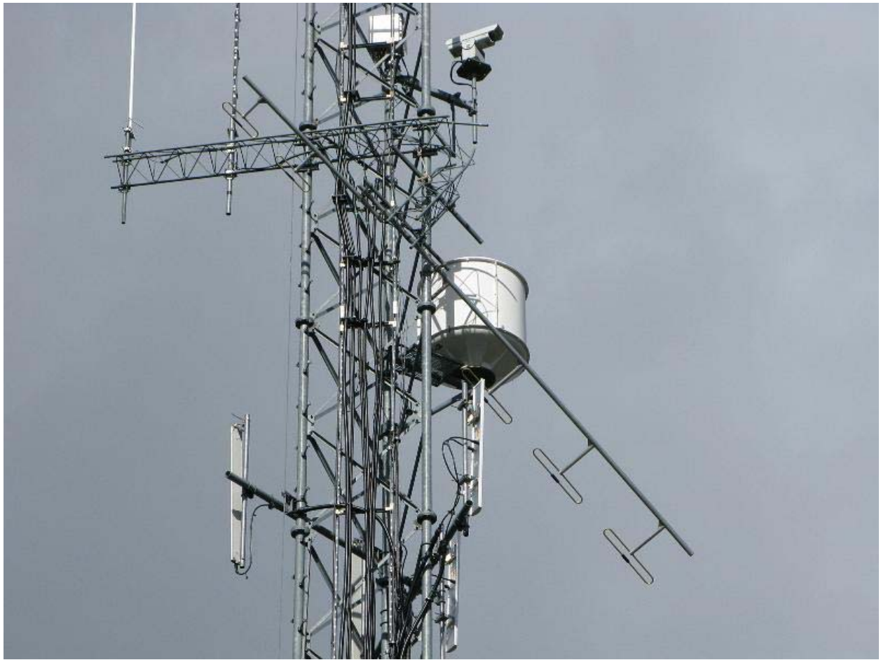
Damage to lower cross-member – May 2008