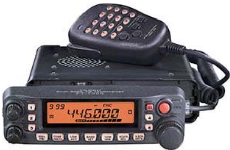
2 nd Prize: Yaesu FT-7900R!!