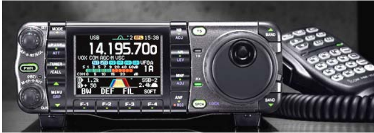
1 st Prize: Icom IC-7000 !!!

Concessions including Coffee, donuts, pizza and soft drinks!