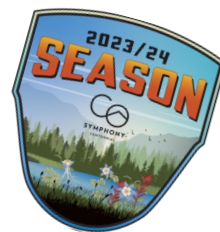
Denver Performing Arts Center Tickets