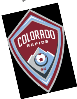
Soccer Game Tickets