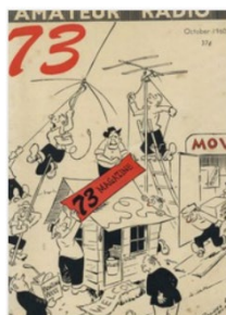
73 Magazine (October 1960)

73 Magazine was published from 1960 until it folded in 2003. Want to look at an old copy? They are available on-line at https://archive.org/details/73-magazine?sort=-date