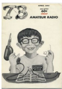
73 Magazine (April 1967)